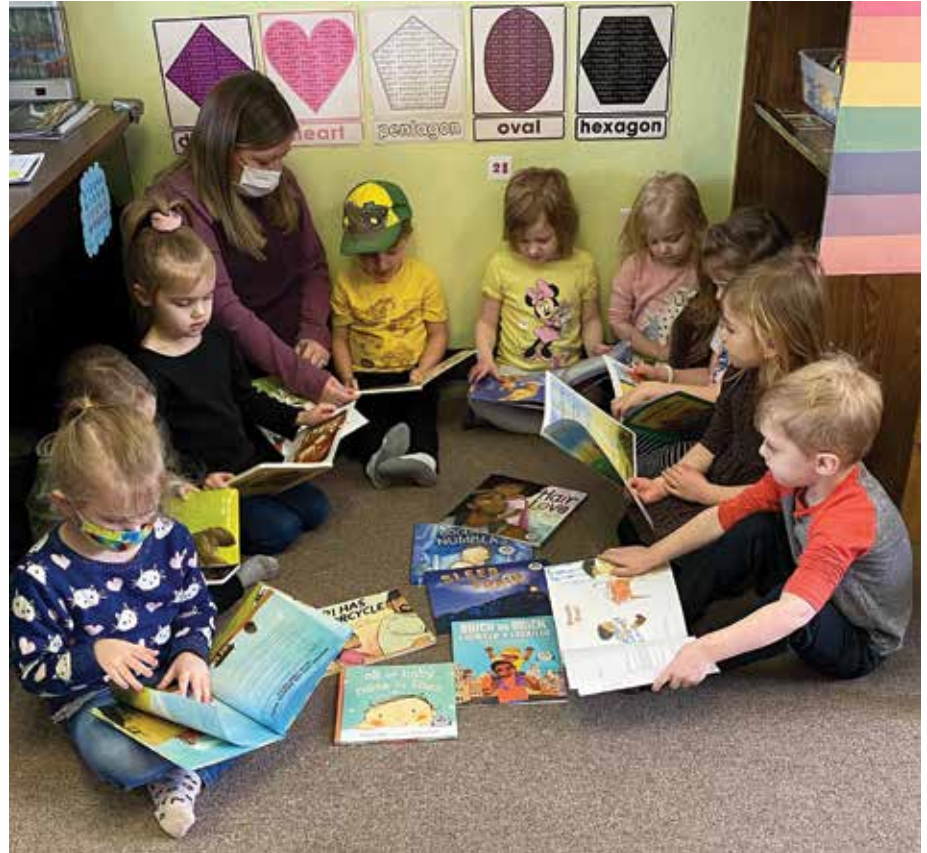
CIRCLE TIME: Students at Country Kids Daycare in Somerset take their first glimpse at new books recently donated to the program's library by Somerset REC. The reading starter pack was provided by the Dolly Parton Imagination Library and sponsored by Touchstone Energy® Cooperative.

Parton's Imagination Library has become the pre-eminent early-childhood, book-gifting program in the world. The flagship program of The Dollywood Foundation has gifted more than 150 million free books in Australia, Canada, The Republic of Ireland, United Kingdom and the United States. The Imagination Library mails more than 1.8 million high-quality, age-appropriate books each month to registered children from birth to age 5.